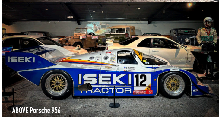
ABOVE Porsche 956