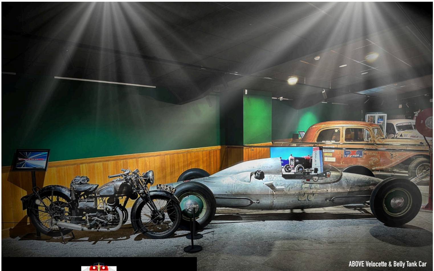
ABOVE Velocette & Belly Tank Car