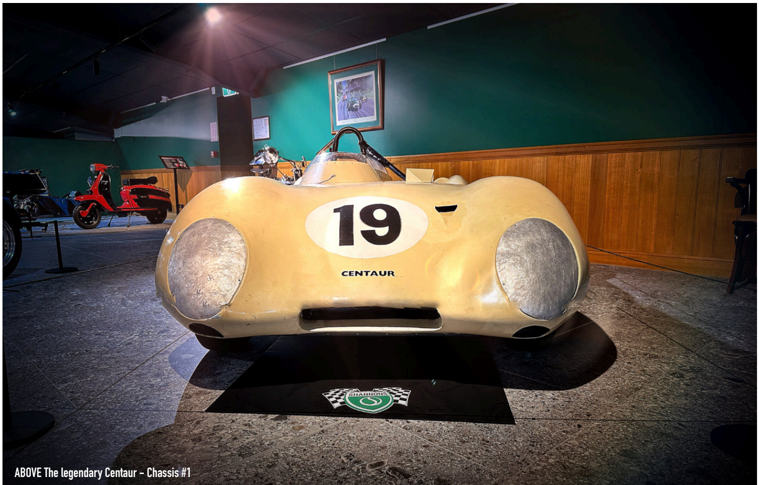
ABOVE The legendary Centaur - Chassis #1