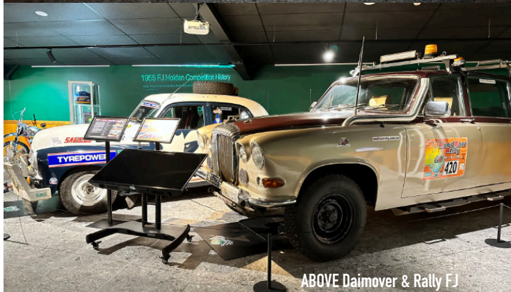
ABOVE Daimover & Rally FJ

variations of Repco Brabham, a sight rarely seen side by side, both with enormous racing and ownership history.