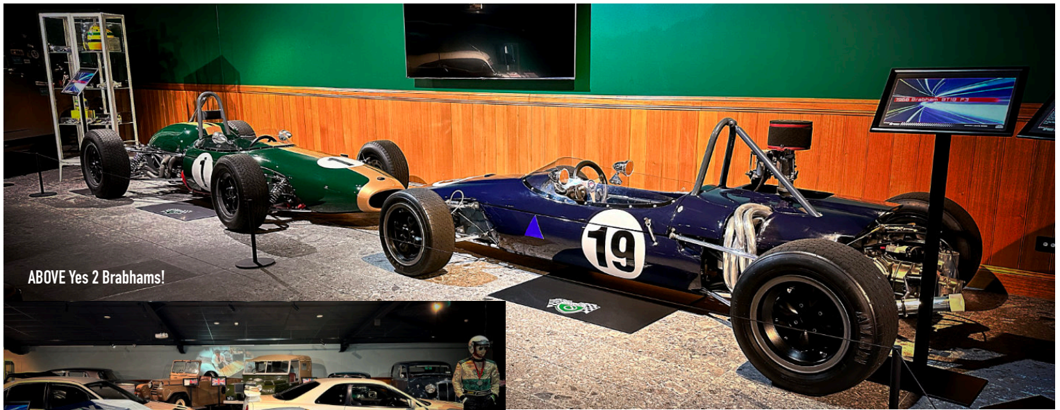
ABOVE Yes 2 Brabhams!