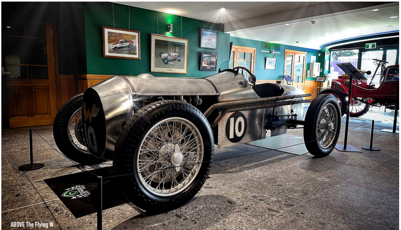
ABOVE The Flying W