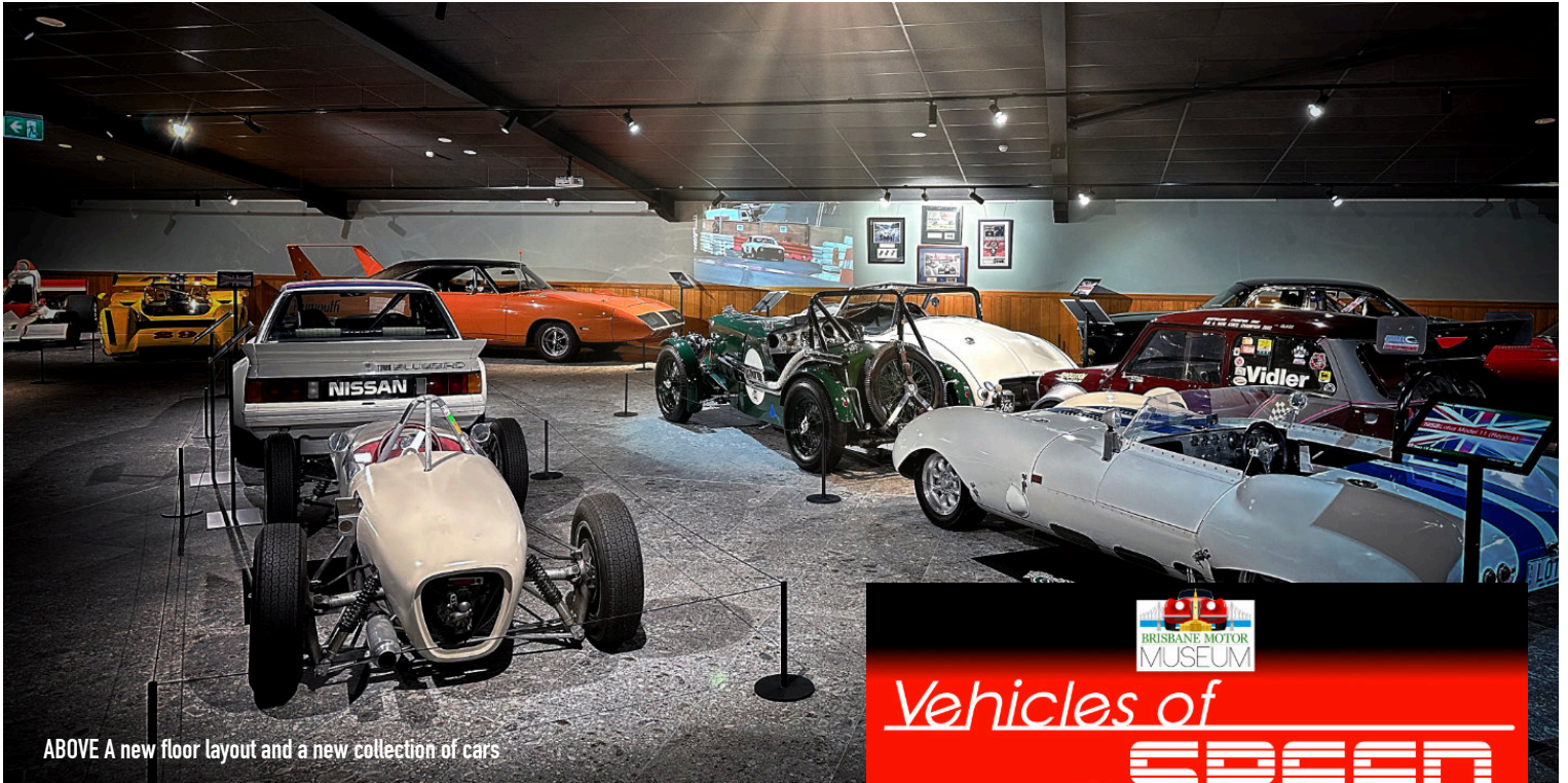
ABOVE A new floor layout and a new collection of cars