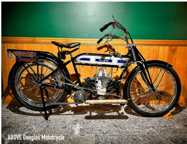
ABOVE Douglas Motocycle